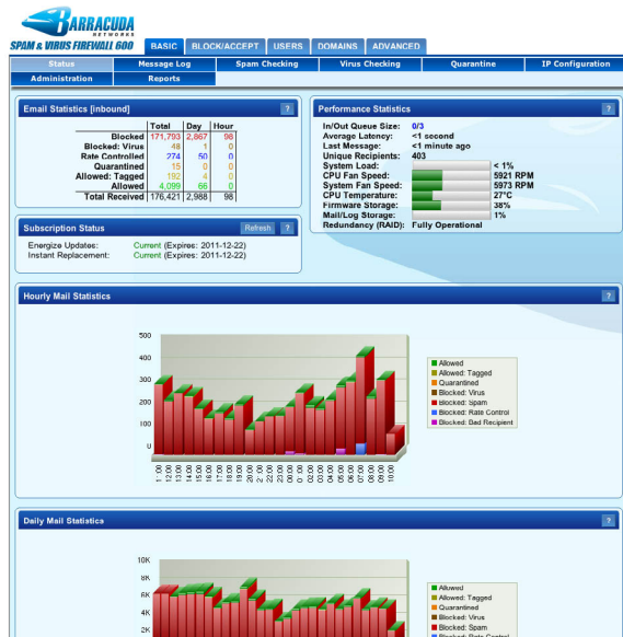
The Barracuda Spam Firewall Vx filters all email messages and displays the number of emails received with statistics on how they were processed.

The Barracuda Spam Firewall Vx is available in four editions handling up to 10,000 email users. Multiple Barracuda Spam & Virus Firewalls can be clustered for more capacity and high availability.